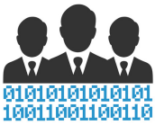
CERT-SOC WORKING GROUP

To access the draft programmes and logistics details of each of the respective group meetings, follow the links on the icons below.