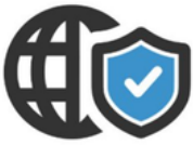
CERT-SOC WORKING GROUP

Two working groups are going to meet in Mechelen, Belgium, 1-2 April 2025, hosted kindly by Telenet! Two separate programmes are being drafted for the two groups.